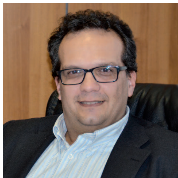
Giuseppe Pace, Ceo of Exor International in San Giovanni Lupatoto (Verona)

What solutions does the UniOP family include? "It is currently available in over 100 different models and has a range of easily programmed HMI devices. This means it can completely adapt to different industrial equipment in the most varied application fields, as well as substantially reducing costs for the cre-